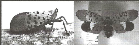
Adult Spotted Lanternfly, present in autumn months.