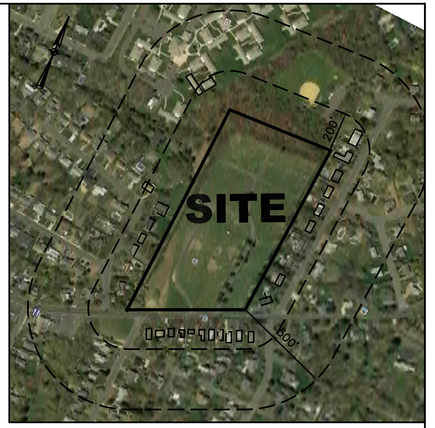
AERIAL MAP SCALE 1"=300'

BOROUGH OF WEST LONG BRANCH, MONMOUTH COUNTY, NEW JERSEY