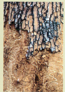
Galleries under bark