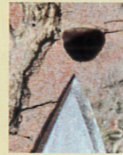
D-shaped exit hole