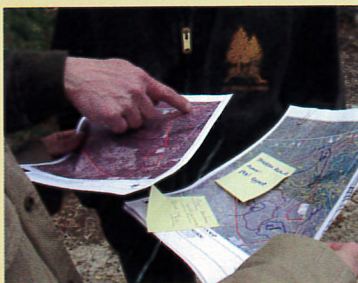
Forest management plan

Woodland owners with an approved forest management plan that addresses emerald ash borer can salvage and restore ash in riparian areas when they follow the prescribed Best Management Practices.