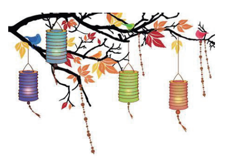
Lantern Walk: November 15, 2024